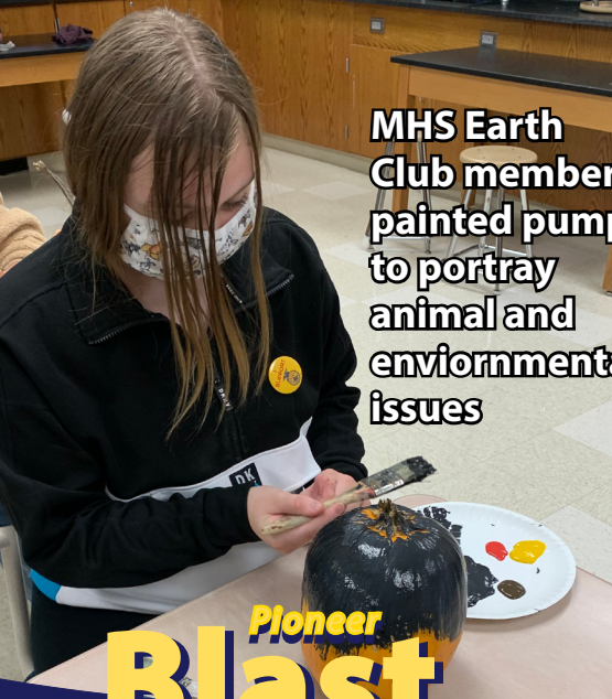
MHS Earth Club members painted pumpkins to portray animal and environmental issues